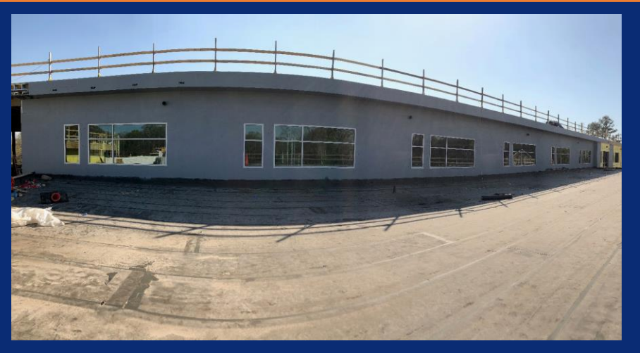
Storefront and glazing installed on elevation F-1 (fifth grade classrooms)