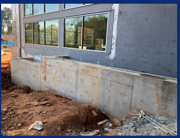
Poured planter walls at lower level vestibule entry / cafeteria

Roofing over roof 5 in progress (STEM lab, chorus, etc.)