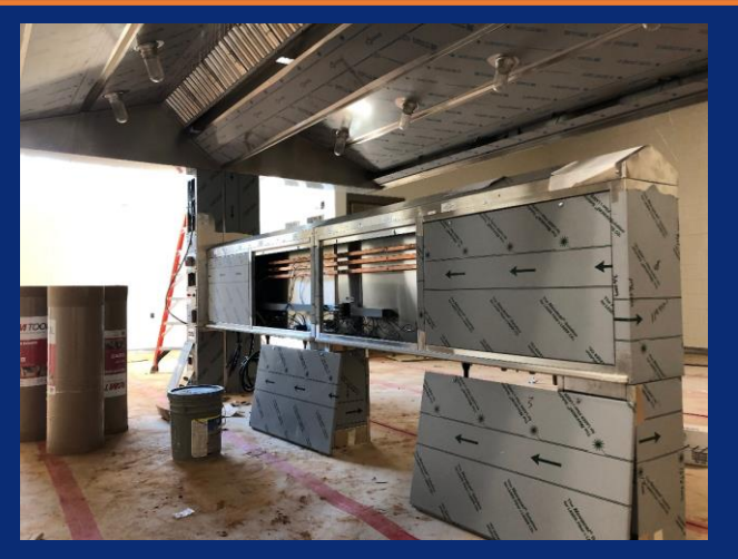
UDS install in progress