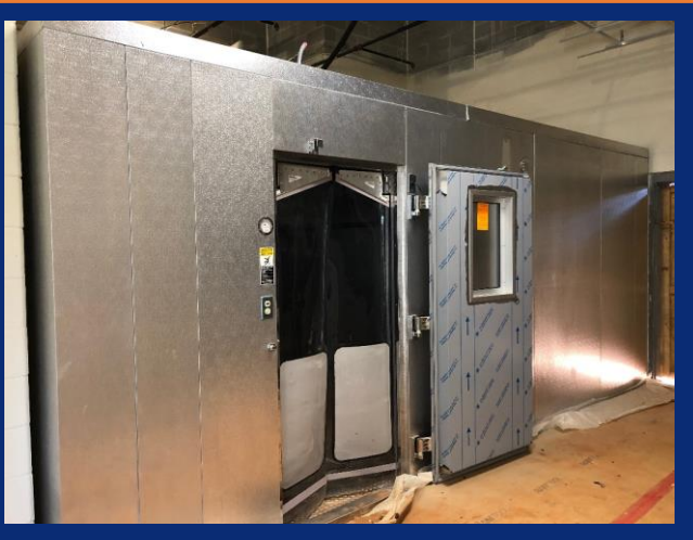
Walk-in freezer/cooler install in progress