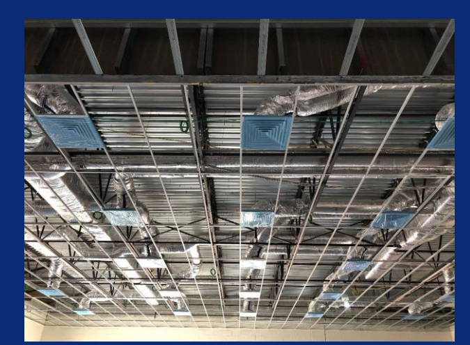
OH grid and rough-in complete in cafeteria