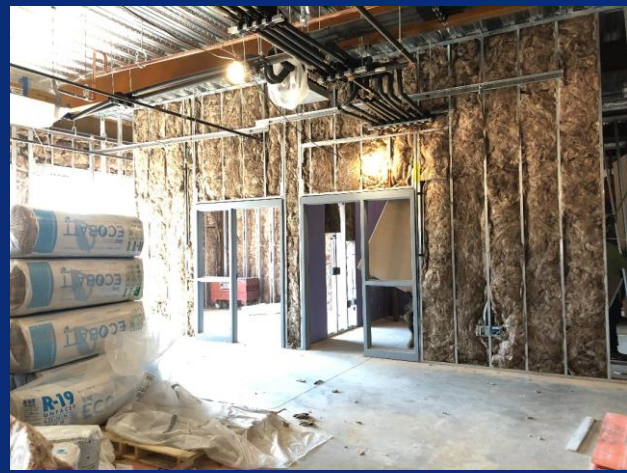
Insulation install commencing following in-wall cover inspections