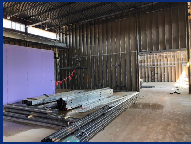
One-siding walls on 2<sup>nd</sup> floor east